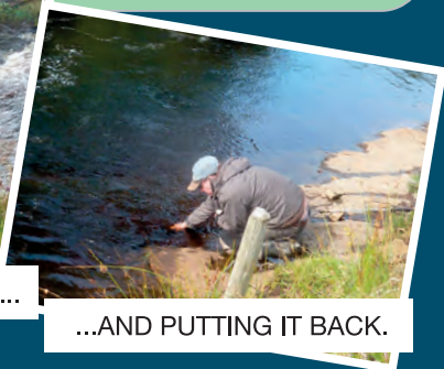
...AND PUTTING IT BACK.